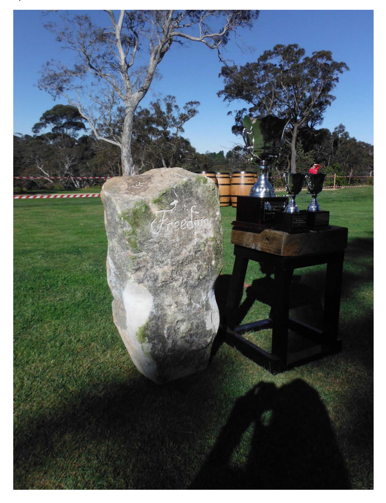
Recent Carry Of The Freedom Stone