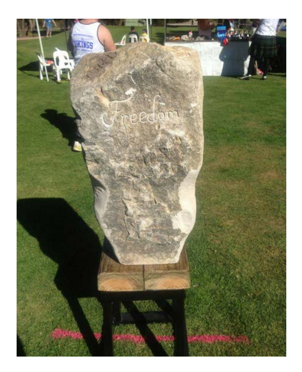
Weight 195.4kg /429lb( natural stone ) Height 86cm Side thickness 23cm front across the bottom 35cm front across the top 42cm

The winner of the Freedom Stone carry on the day was Blue Mountains local Luke Reynolds who set a distance of 24.8m up a slight hill, followed closely by Jordan Steffens of South Australia.