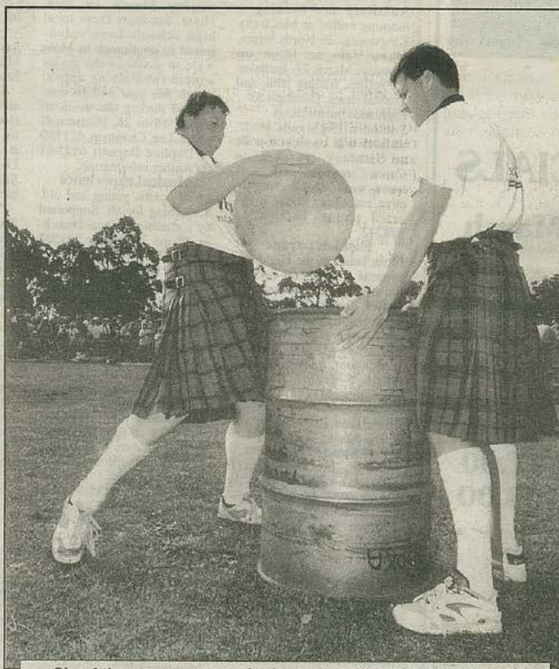
Six of the strongest men in the world will be displaying their strength at the Bundanoon Highland Gathering.